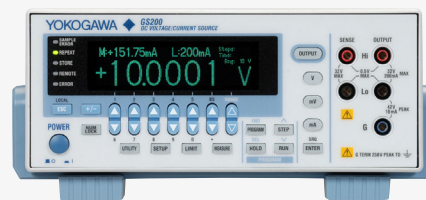
Fig. 1. The highly stable GS200's outstanding Low-noise performance delivers extremely low noise DC signals used in a wide range of design processes.

To fine-tune the magnetic field, which is an inevitable requirement for initializing a quantum computer, a nanometer-size wire in the proximity of the superconducting loop is used to produce magnetic field and consequently tune the qubit energies. To generate the stable and small current a GS200 DC voltage and current source is used that offers an extremely low noise floor.